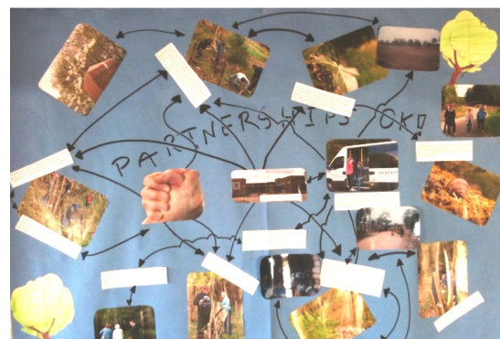
Dalbeattie High School entry