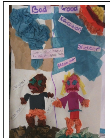
Poster by Lockerbie Academy pupil

Other creative schools such as Killermont Primary School made a poem of the 'rights of the child', Castlehill Primary School in Fife put together a charter on rights and pupils from Strathaven Academy made a poster on the rights of the Scottish child to send to their partner school in Malawi. For many schools, this was a great opportunity to gather evidence to apply for the Unicef 'Rights Respecting Schools' award and an interesting way for pupils to compare their rights with those of their partner school.