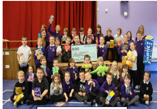
Pupils from Boghall PS

Since January everyone in the school has been working hard to contribute to the fundraising event.