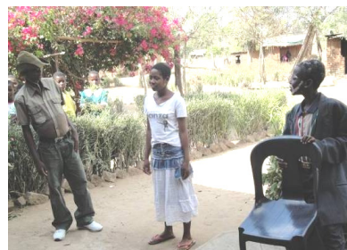
Chikololere Primary School, UNICEF Rights Respecting School award workshops

Why not work together with your partner school to achieve an RRSA and see the benefits it brings to your school's life. www.unicef.org.uk/tz/teacher_support/rrs_award.asp