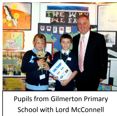
Pupils from Gilmerton Primary School with Lord McConnell

Teachers and pupils from Craighead Primary School, Dalbeattie High School, South Morningside Primary School, Gilmerton Primary School and Castlehill Primary School exhibited and discussed the joint curricular work they have produced in partnership with pupils from their Malawian partner schools.