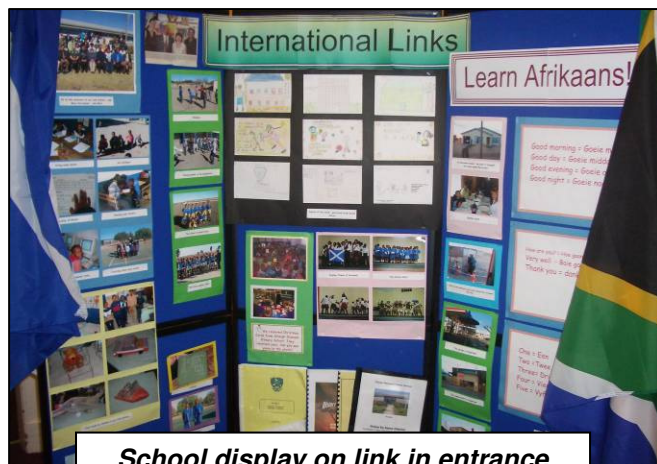
School display on link in entrance hall at Longniddry Primary School